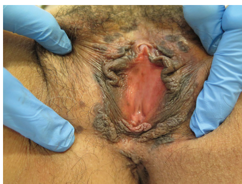
Figure 3. Thirty-nine-year-old patient with uVIN. Multifocal bilateral brown papules on the labia majora from the anterior part of vulva until the perineum.