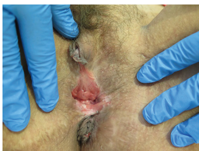
Figure 2. Thirty-eight-year-old patient with uVIN. Confluent white plaques on the posterior vaginal vestibule after partial simple vulvectomy for superficially invasive keratinising squamous cell carcinoma.