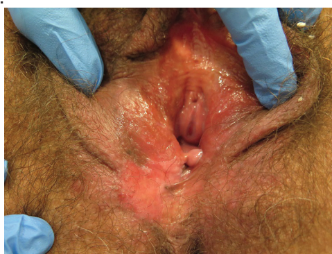
Figure 5. Fifty-nine-year-old patient with uVIN. Unifocal white, red, and brownish plaque on the right posterior part of the vulva, in the context of diffuse vulvar erythema, with excoriations caused by scratching.